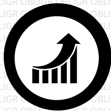
SEO - ON Page/ OFF Page