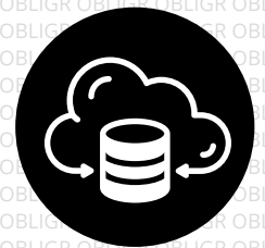
Building a Hosting Server