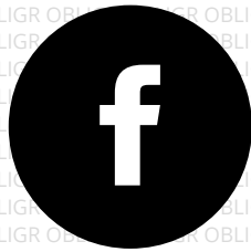
Facebook & Instagram Ads