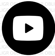
Becoming a YouTuber