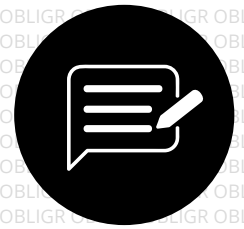
Becoming a Blogger