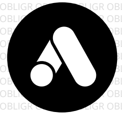
Google & YouTube Ads